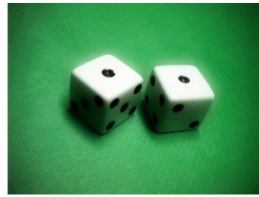
two dice dices