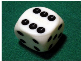
a dice (or a die)