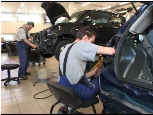
metal sheet worker for body cars